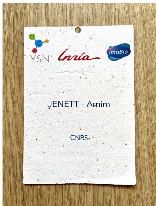
Fig. 2. Ecological badge of one of the participants.